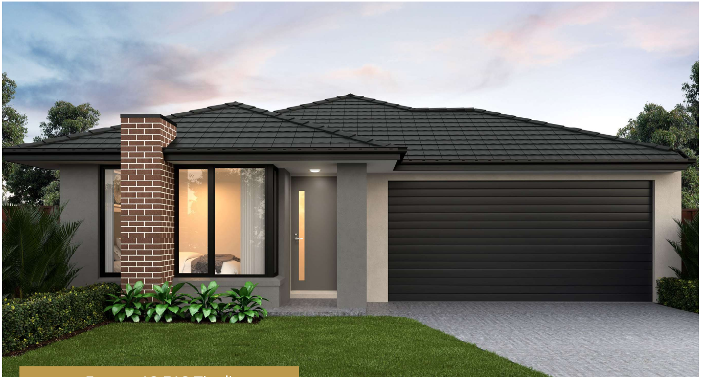
Easton 18 E18 Tivoli

LOT 860 COFFEY STREET, HUNTLY PROVENANCE ESTATE