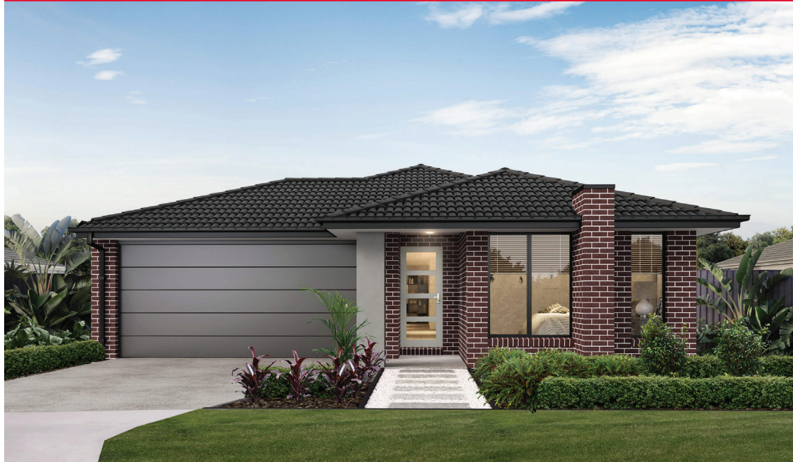
LENOX 24_224 | METRO RANGE